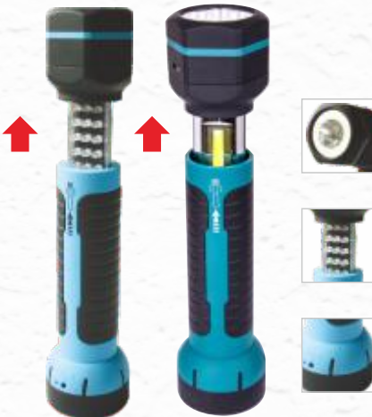
LED Version COB Version